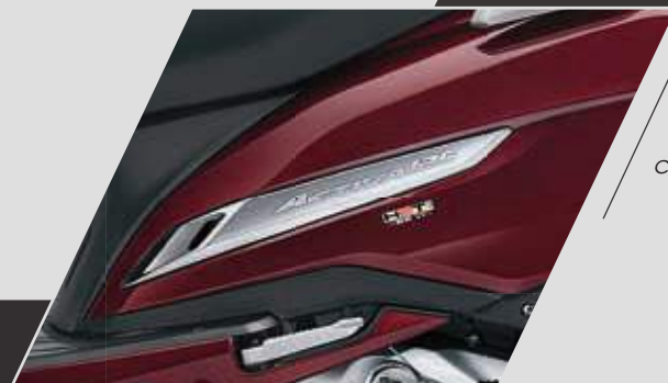
PREMIUM CHROME ON BODY

Spacious front glove box adds additional storage space.